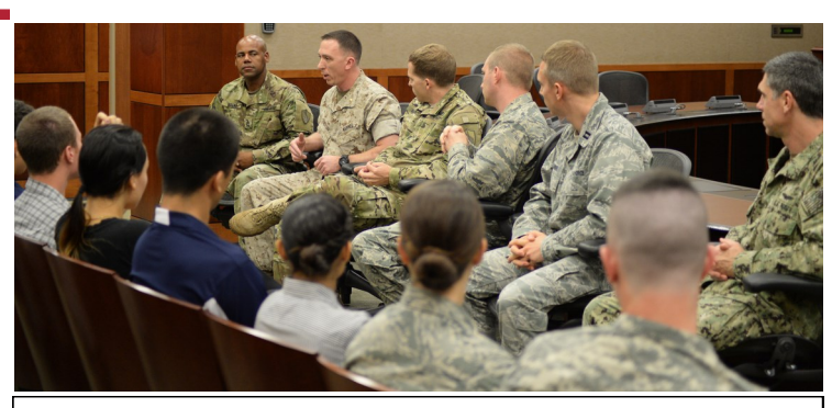
O & A session with the CENTCOM staff. US Central Carp and Mission Statemen: International Journal of the Community of the Community of the Community of the Community of the Community of the Community of the Community of the Community of the Community of the Community of the Community of the Community of the Community of the Community of the Community of the Community of the Community of the Community of the Community of the Community of the Community of the Community of the Community of the Community of the Community of the Community of the Community of the Community of the Community of the Community of the Community of the Community of the Community of the Community of the Community of the Community of the Community of the Community of the Community of the Community of the Community of the Community of the Community of the Community of the Community of the Community of the Community of the Community of the Community of the Community of the Community of the Community of the Community of the Community of the Community of the Community of the Community of the Community of the Community of the Community of the Community of the Community of the Community of the Community of the Community of the Community of the Community of the Community of the Community of the Community of the Community of the Community of the Community of the Community of the Community of the Community of the Community of the Community of the Community of the Community of the Community of the Community of the Community of the Community of the Community of the Community of the Community of the Community of the Community of the Community of the Community of the Community of the Community of the Community of the Community of the Community of the Community of the Community of the Community of the Community of the Community of the Community of the Community of the Community of the Community of the Community of the Community of the Community of the Community of the Community of the Community of the Community of the Community of the Community of the C