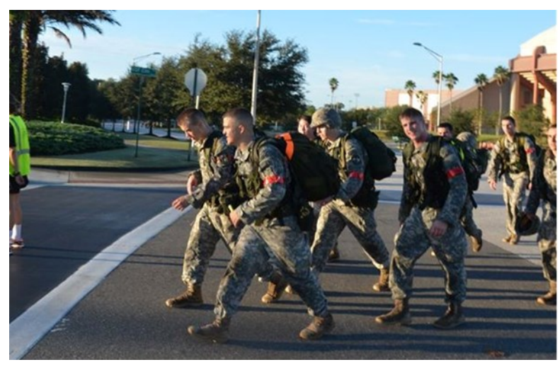
USF RC Team One in the lead during the final ten mile ruck march.

Eventually USF Team One broke free from the herd as they claimed the lead and managed to hold that position, with some comfort, the entire distance. USF Team One went on to take the first place in every event that day except for the Rope bridge event, where USF Team Two claimed the lead. In the end, the scores proved solid and secured USF Team One a top-ten victory in the Brigade!