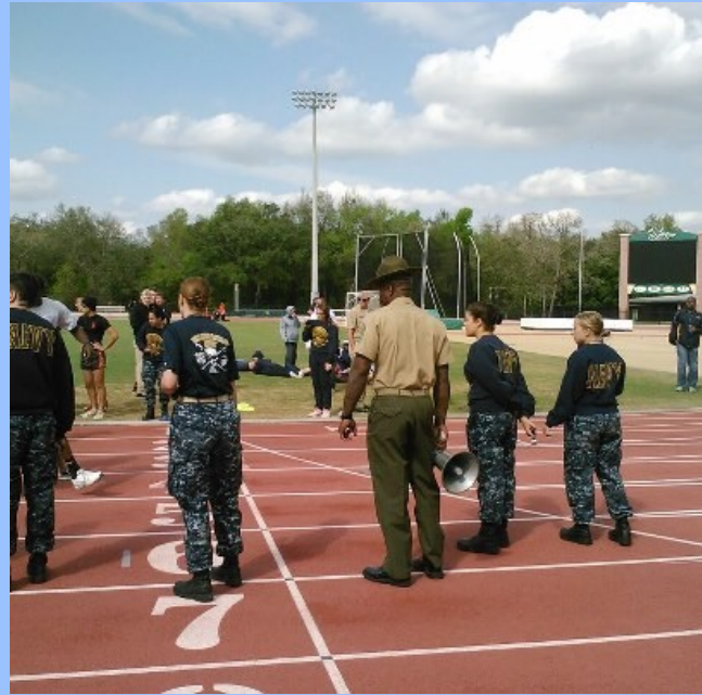
Ninth Annual Battle of the Bulls