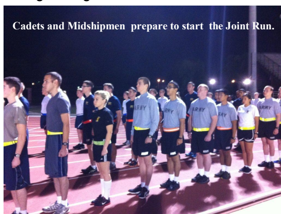
Cadets and Midshipmen prepare to start the Joint Run.