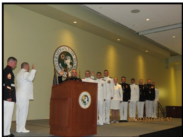
2013 Spring Commissioning, USF Marshall Center

Overall it was an outstanding and rewarding year for everyone here at USF, and we look forward to beginning the new school year with the incoming freshman class. New student orientation will begin 19 August here at the Congressman Bill Young (CWY) building on campus. We hope to see you there!