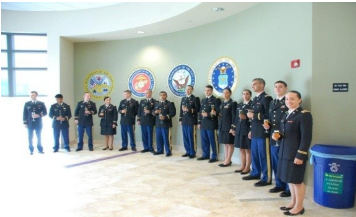
USF Tampa and USF St. Pete Commissionees