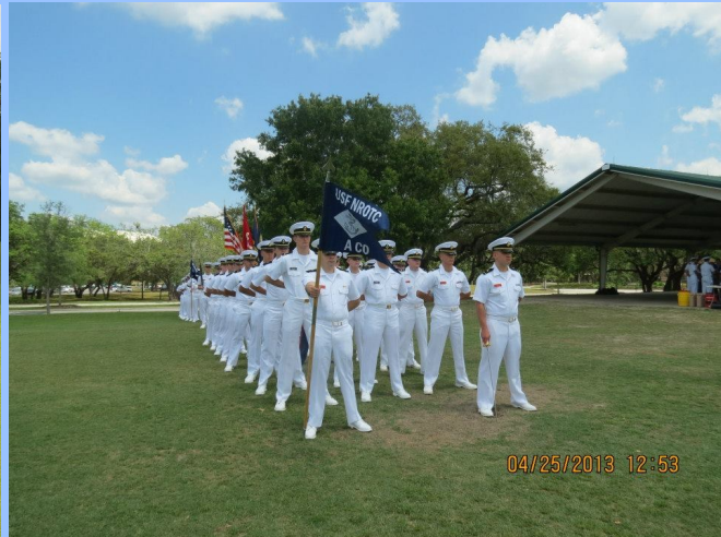
⬆ Spring 2013 Pass In Review and Awards Ceremony ⬇