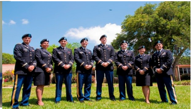
St. Leo Commissionees