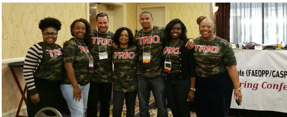
Student Support Services and Upward Bound personnel attended the Florida Association of Education Opportunity Program Personnel (FAEOPP) professional development conference in Savannah, Georgia... TRIO Works!