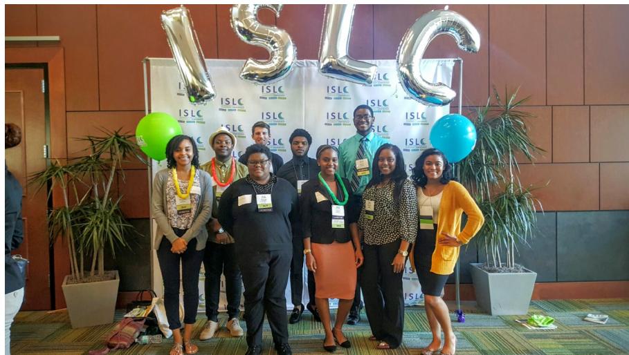
SSS students attended the USF Intercultural Student Leadership Conference