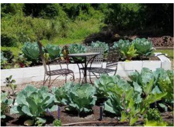
Circle Pond Tiny Home Community Sarasota, FL