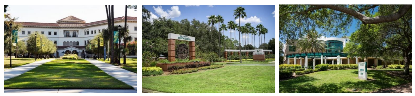
We are One USF. The University of South Florida has campuses in <u>Sarasota-Manatee</u> (left), <u>Tampa</u> (center), and <u>St.</u> <u>Petersburg</u> (right).

To learn more about USF, we invite you to explore <u>About USF</u> on our website, review the <u>USF Strategic Plan</u>, and learn about our <u>Points of Pride</u>, including some impressive enrollment statistics and important facts about the university.