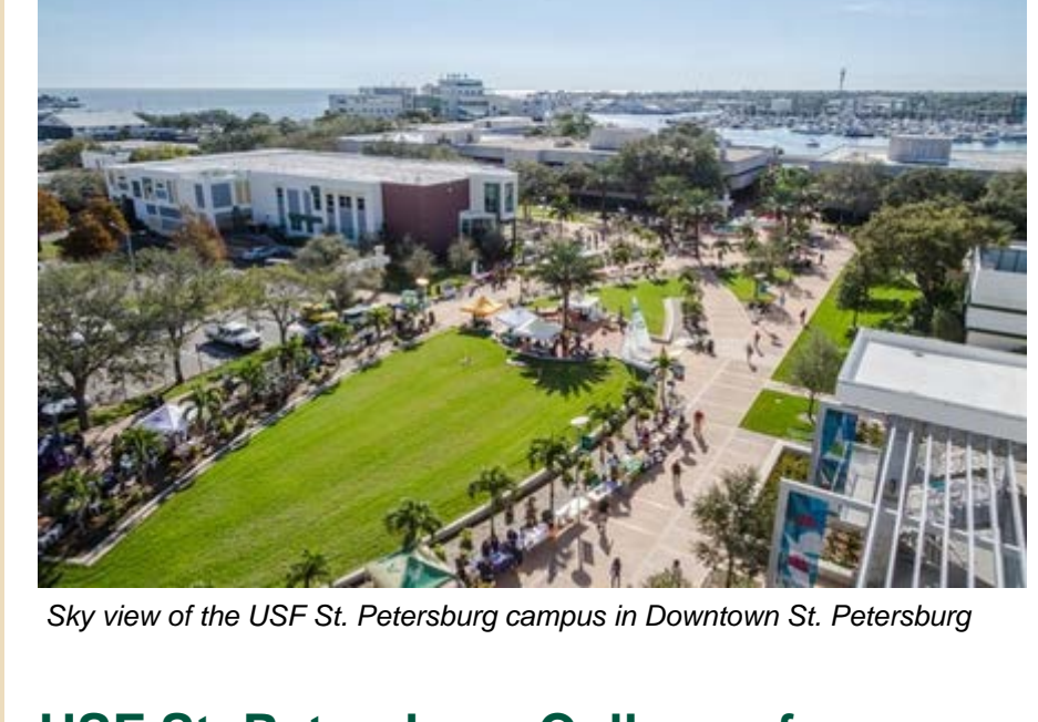
USF St. Petersburg College of Business Facility

this issue we will detail our two top construction priorities for this session: the USF St. Petersburg College of Business and the USF Health Heart Institute.