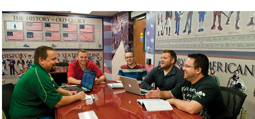
USF Student Veterans in the Veterans Achievement Center on USF's Tampa Campus.

We already have some great news to share with you about the 2014 Legislative Session. On March 11 th , the Florida Senate took up HB 7015, which was unanimously passed in the House, and passed the measure unanimously. HB 7015, better known as the Florida GI Bill, is a comprehensive bill aimed to show the state's gratitude for the service of our military.