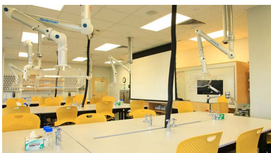
USFSM laboratory at the Mote Marine Laboratory in Sarasota.

To send us your feedback or ideas email govrelations@usf.edu .