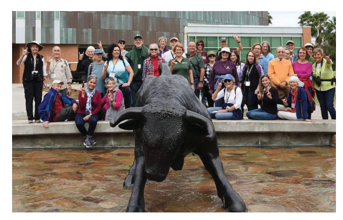
OLLI Hikers on Campus