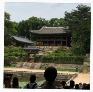
Secret garden in an old dynasty palace in Seoul