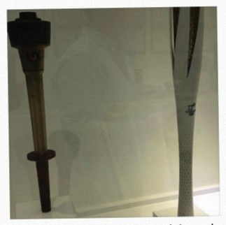
THE torches that toured the globe and illuminated the opening ceremonies for both the 1988 and the 2018 Olympics. Notice the brail on the handle!