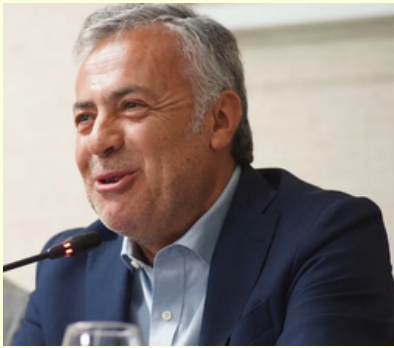
Alfredo Cornejo, Governor of Mendoza