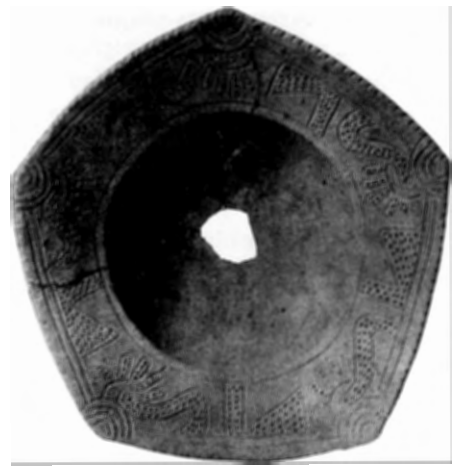
Figure 1. Fort Walton Incised open bowl forms distinctive to Mississippi-period northwestern Florida: left, six-pointed vessel from Mound at Walton's Camp (Fort Walton Temple Mound, 8OK6; adapted from Moore 1901:444, Figure 22); right, five-pointed vessel from Mound Near Jolly Bay (8WL15; adapted from Moore 1901:460, Figure 51).

(sometimes 5-pointed) open bowls (Figure 1), which apparently do not appear elsewhere in the Mississippiperiod Southeast (White et al. 2012). No functional reasons (such as lack of shell for temper or use with special regional foods requiring such a vessel shape) exist to account for this distinctiveness in both style and technology. Thus these ceramics might be interpreted as manifesting regional preferences, evidence of isolation or interaction, resistance, or simply identity maintenance. Whatever the case, such unusual artifact types resist purely scientific explanation.