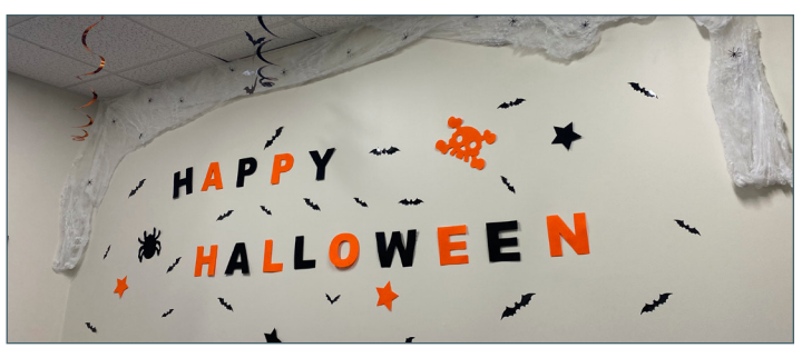
Spider Webs covered the Business Center breakroom

OAS got into the Halloween spirit this year with a decorating contest. Four areas participated in this year's decorating contest: Parking and Transportation Services, the Business Center, the Post Office, and Building Services. Each area was invited to show their spirit by decorating an area of their space. On October 29, two student judges visited each area that participated in the contest, and delivered a trophy to the winning area: the Post Office! Thank you to everyone who participated in the contest, we're thrilled to show off the decorations here.