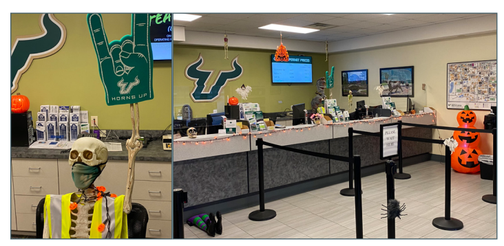
Parking and Transportation Services had an extra scary employee working during October. He's got spirit for sure!