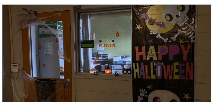
Decorations by Building Services. (Spooky music emanating from the office not pictured.)