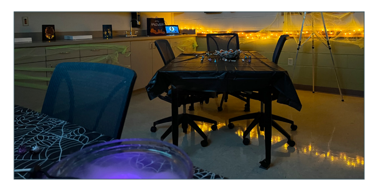
Pictured above: The Post Office breakroom, complete with lights, fog, spider webs, and candy at every table. Pictured right: April Amorose, USF's oldest Postman, and Carrie Towner show off their trophy.