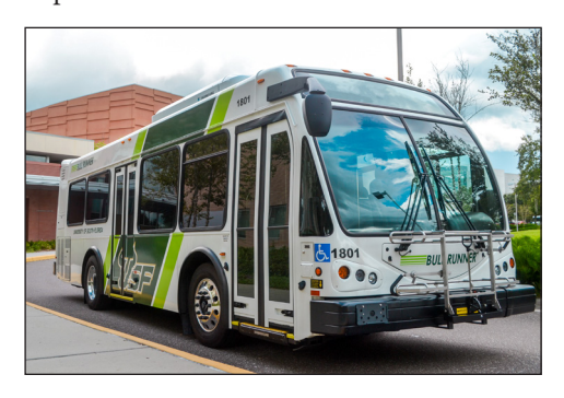
One of the new buses purchased by PATS. Photo taken outside of the School of Music Building.

The University of South Florida's Parking and Transportation Services Division (PATS) recently purchased two new Bull Runner buses as part of their strategic goal to replace the aging Bull Runner fleet. The purchase of these new buses enables PATS to retire two older buses that had increasing maintenance costs and down time. These new buses are expected to join the Bull Runner fleet's normal operation by September 2018.