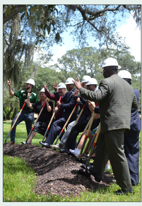
Administration, staff, and students involved in the NPHC Plaza project pose for a photo during the groundbreaking ceremony.