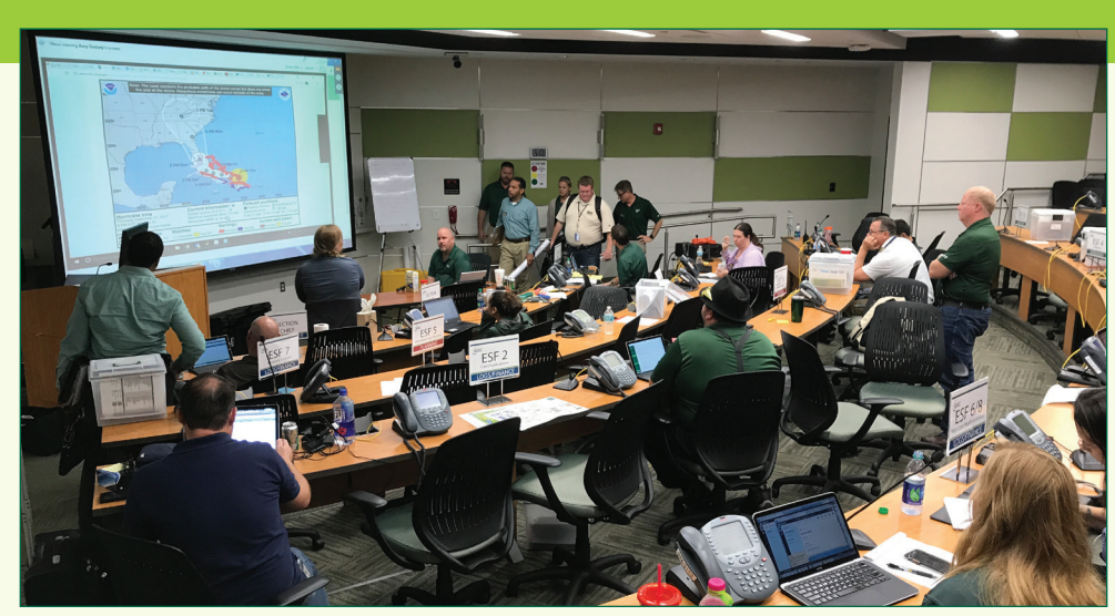
USF System Emergency Operations Center, staffed by numerous Emergency Support Functions or "ESF"s.

That afternoon the decision was made by USF senior leadership to close all System