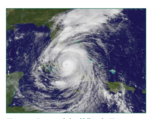
Hurricane Irma made landfall in the Keys as a Category 4 hurricane on the morning of September 10 with sustained winds of 130 mph.

Points of contact were established for students, faculty, and staff who needed assistance or had questions. Messaging to the USF community included links to the official USF Hurricane Guide and hurricane preparedness information on the USF Emergency Management website. As Hurricane Irma approached, the USF Emergency Management website jumped from an average of 68 visitors per day to over 17,200 visitors per day. The Dean of Students' office became an information