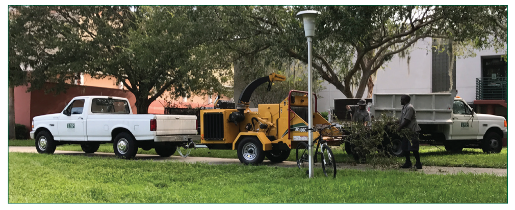
USF Facilities Management, Services personnel were on the job shortly after Irma passed, getting the campus cleaned up and looking great!

The Provost's office took the lead in establishing information hotlines for students and employees and an FAQ page was added to the information made available on USF's main website. The hotline numbers received almost 200 calls. It was made clear that if students and employees were unable to return to campus due to impacts of the hurricane,