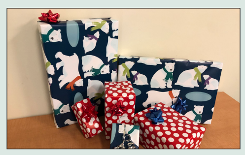
Gifts wrapped during OAS Gift Wrapping Days.

The USF Faculty and Staff campaign is a fundraising effort that allows USF employees to make a gift to the area of their choice. Employees can choose to directly support an area anywhere in the USF system that they are passionate about. These gifts make a lasting impact on various areas at USF.